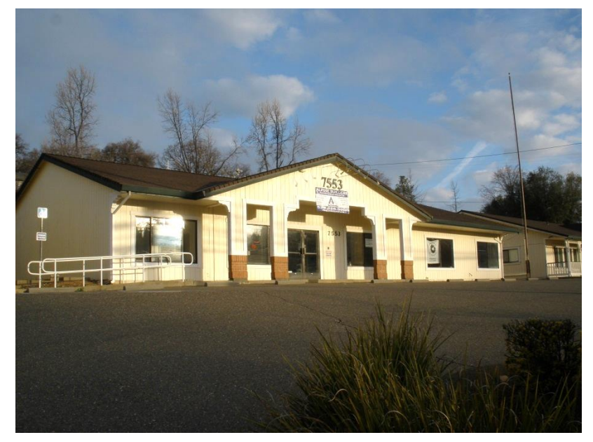
Figure 1. Front Building Elevation of 7553 Green Valley Road